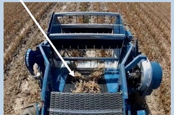
Forced air directs plants to center for optimal threshing