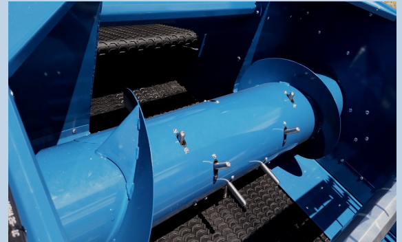
Optional infeed auger for FSAH-60S